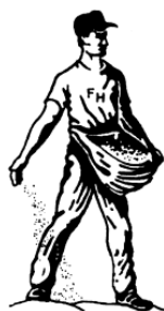
The FarmHouse Foundation

Support for RLCs is provided by The FarmHouse Foundation, Monsanto, the Undergraduate Challenge, and local chapter associations and foundation councils. Participants are encouraged to thank these sponsors and donors for their support of FarmHouse International’s educational programs.